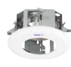
WV-QEM505-W Ceiling Mount Bracket