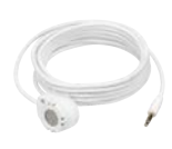
WV-PM500 Compact microphone unit for surveillance cameras