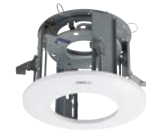
WV-QEM101-W Ceiling Mount Bracket