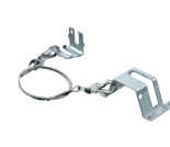
WV-Q105A Mount Bracket