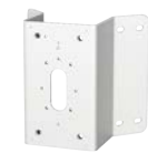
WV-QCN500-W Mount Bracket