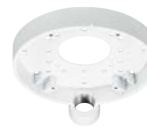
WV-QJB504-W Base Bracket