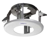
WV-QEM500-W Mount Bracket