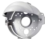
WV-QSR500-W Sun Shade