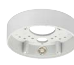
WV-QJB501-W Base Bracket