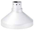
WV-QSR501-W Mount Bracket