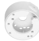
WV-QJB502A-W Mount Bracket