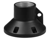
WV-QCL101-B Mount Bracket