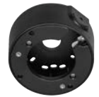
WV-QJB502A-B Mount Bracket