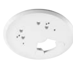
WV-QAT502-W Gangbox Adapter