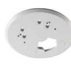
WV-QAT502-G Gangbox Adapter