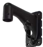
WV-QWL501-B Mount Bracket