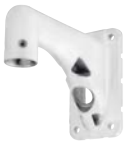
WV-QWL501S-W Wall Mount Bracket