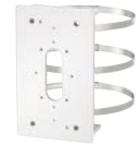
WV-QPL500-W Mount Bracket