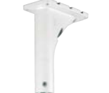
WV-QCL501-W Mount Bracket