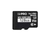
WV-SDB128G i-PRO SD Memory Card