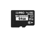
WV-SDB064G i-PRO SD Memory Card