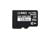
WV-SDB128G i-PRO SD Memory Card