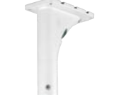
WV-QCL501-W Mount Bracket