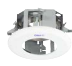
WV-QEM505-W Ceiling Mount Bracket