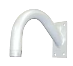
PWM25W Gooseneck Wall Mount