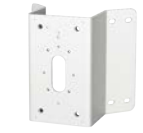
WV-QCN500-W Mount Bracket