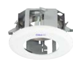
WV-QEM505-W Ceiling Mount Bracket