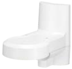
WV-QWL502-W Mount Bracket