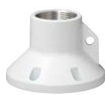
WV-QCL101-W Mount Bracket