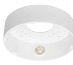
WV-QJB505-W Base Bracket