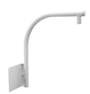
PPRM35W Parapet Mount Bracket