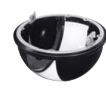
WV-QDC508C Dome Cover