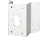
WV-QCN500-W Mount Bracket