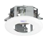
WV-QEM505-W Ceiling Mount Bracket