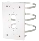
WV-QPL500-W Mount Bracket