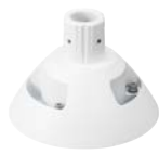
WV-QSR504S-W Mount Bracket