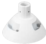
WV-QSR504S-W Mount Bracket