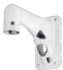
WV-QWL501S-W Wall Mount Bracket

Select a compatible accessory Accessory Selector (i-pro.com) .