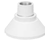
WV-QSR506F1-W Mount Bracket