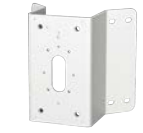
WV-QCN500-W Mount Bracket