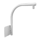
PPRM35W Parapet Mount Bracket