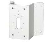
WV-QCN500-W Mount Bracket