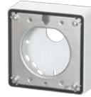
WV-QJB500-W Mount Bracket