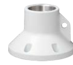
WV-QCL101-W Mount Bracket