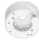
WV-QJB502A-W Mount Bracket