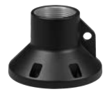
WV-QCL101-B Mount Bracket