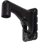
WV-QWL501-B Mount Bracket