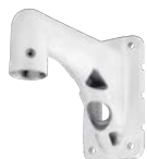
WV-QWL501S-W Wall Mount Bracket