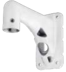
WV-QWL501S-W Wall Mount Bracket