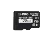
WV-SDB128G i-PRO SD Memory Card