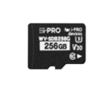
WV-SDB256G i-PRO SD Memory Card