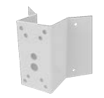
PACA4W Corner Mount Adapter Bracket