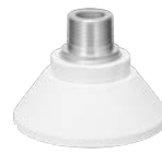
WV-QSR506M-W Mount Bracket