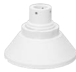
WV-QSR506-W Mount Bracket