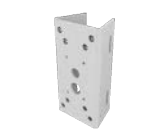
PAPM4W Pole Mount Bracket