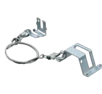
WV-Q105A Mount Bracket