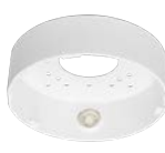
WV-QJB505-W Base Bracket