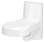
WV-QWL502-W Mount Bracket