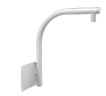
PPRM35W Parapet Mount Bracket