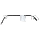
WV-QCA501A I/O Cable