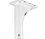
WV-QCL501-W Mount Bracket