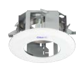
WV-QEM505-W Ceiling Mount Bracket