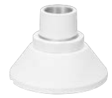
WV-QSR506F-W Mount Bracket