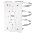
WV-QPL500-W Mount Bracket