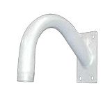
PWM25W Gooseneck Wall Mount