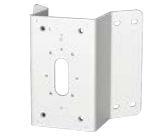
WV-QCN500-W Mount Bracket