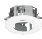
WV-QEM505-W Ceiling Mount Bracket