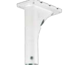
WV-QCL501-W Mount Bracket