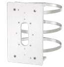
WV-QPL500-W Mount Bracket