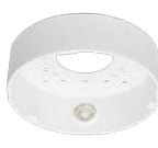
WV-QJB505-W Base Bracket