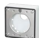
WV-QJB500-W Mount Bracket