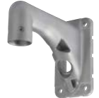
WV-Q122A Mount Bracket