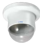
WV-QCD100C-W Dome Cover