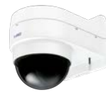
WV-QWD100G-W Wall Mount Bracket