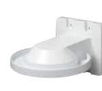
WV-QWL500-W Mount Bracket