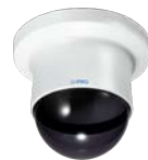
WV-QCD100G-W Dome Cover