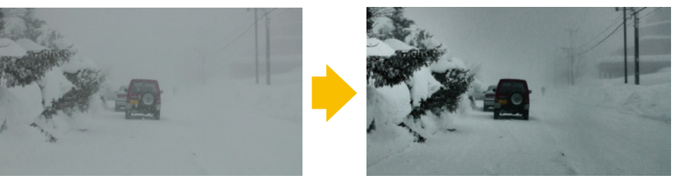
Spatial Tonal Correction, Snowfall and Rainfall Noise Reduction