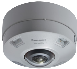
with Base Bracket