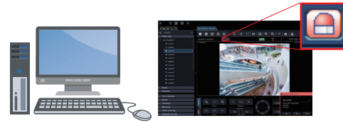
Notification sent to the monitoring screen

i-VMD is possible to detect objects in the specified area by advanced video analysis technology. i-VMD : Intruder Detection, Loitering Detection, Direction Detection, Scene Change Detection, Object Detection, Cross Line Detection