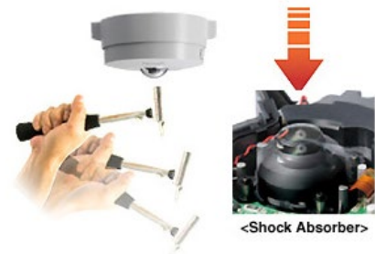
Figure 1. Tough camera protected with built-in shock absorber.

Tampering also interrupts surveillance. Interruptions such as spray-painting on the camera dome, changing the camera direction and covering the camera with something are often