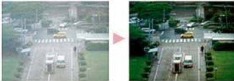
Figures 3 and 4. Outdoor gate. Left: the image is an example without fog compensation. Right: the image is an example with fog compensation running, which reduces the fog impact.

i-PRO Fog and Sandstorm compensation feature, an image processing technology, reduces the impact of fog, smog and sandstorms, delivering clear color images to the operators.