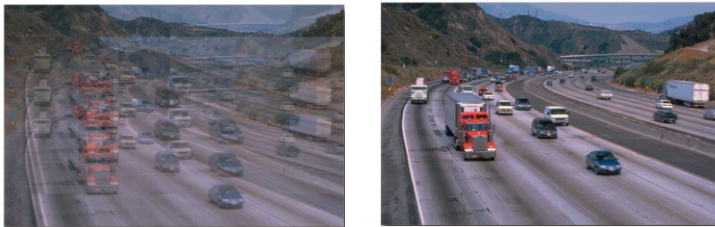
Figure 11. Free-way. Left: Vibration from the road affects the Image. Right: The Auto Image Stabilizer eliminates the vibration effects.

i-PRO Auto Image Stabilizer, an image processing technology, reduces the negative impact of vibrations and delivers clear images to surveillance operators.