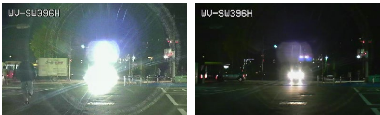
Figures 6 and 7. Left: the image is an example when Super Dynamic technology is turned off. Right: the image is an example when Super Dynamic technology is turned on.

i-PRO developed the industry's first Super Dynamic technology and improved it to Mega Super Dynamic technology, dramatically expanding the dynamic luminance range. The technology measures the luminance of each pixel on the image, adjusts the brightness of parts that are too bright or too dark to the appropriate brightness and produces a clear image. Electrical sensitivity enhancement keeps color images clear, even in dim light.