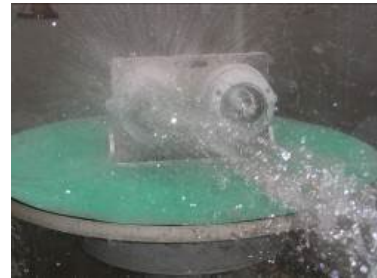
Figure 2. Water resistance test.

The International Electrotechnical Commission (IEC) defines the waterproof performance rating. The Ingress Protection (IP) rating classifies and rates the degree of protection mechanical casings and electrical enclosures provide against the intrusion of solid objects including body parts such as hands and fingers, dust, accidental contact and water. i-PRO outdoor cameras meet IP66, which indicates powerful performance: No dust ingress. The enclosure protects the camera against harmful effects from powerful water jets projected from any direction.