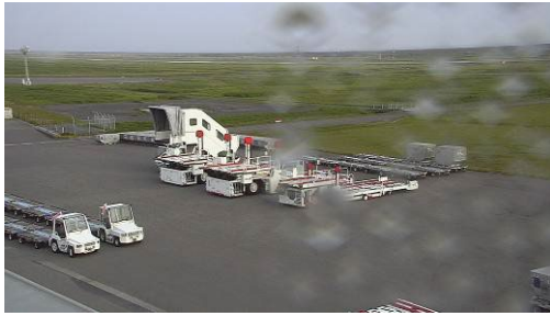
Figure 5. Airport on a rainy day. The left half of the dome is coated with Rain-Wash coating and the image is clear. For comparison, the right half is not coated.