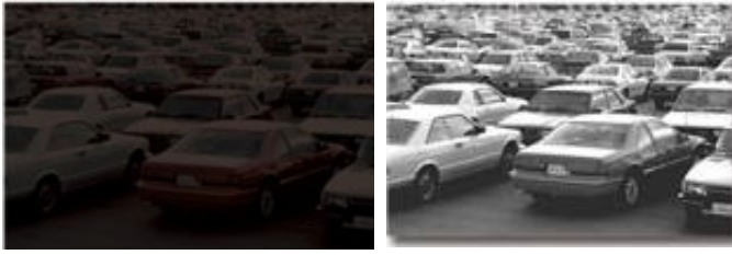
Figures 8 and 9. Parking at night. Left: camera runs in day-mode. Right: camera switches to night mode and infrared light (IR) enhances the image.