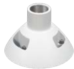
WV-QSR504F-W Mount Bracket