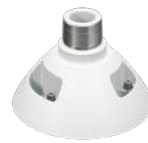
WV-QSR504M-W Mount Bracket