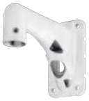
WV-QWL501S-W Wall Mount Bracket