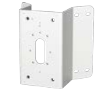
WV-QCN500-W Mount Bracket