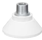
WV-QSR506M1-W Mount Bracket