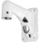
WV-QWL501-W Mount Bracket