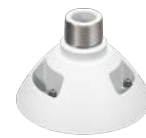
WV-QSR504M1-W Mount Bracket