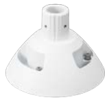
WV-QSR504S-W Mount Bracket