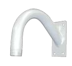
PWM25W Gooseneck Wall Mount