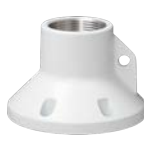
WV-QCL100-W Mount Bracket