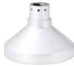
WV-QSR501-W Mount Bracket