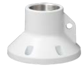
WV-QCLI01-W Mount Bracket